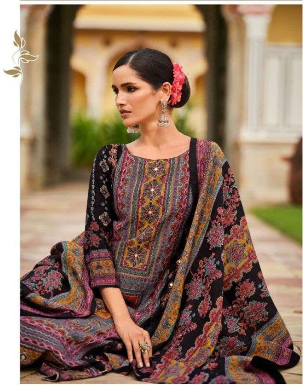
Being your stunning best to match the elegance occasion. Your stunning side this season.