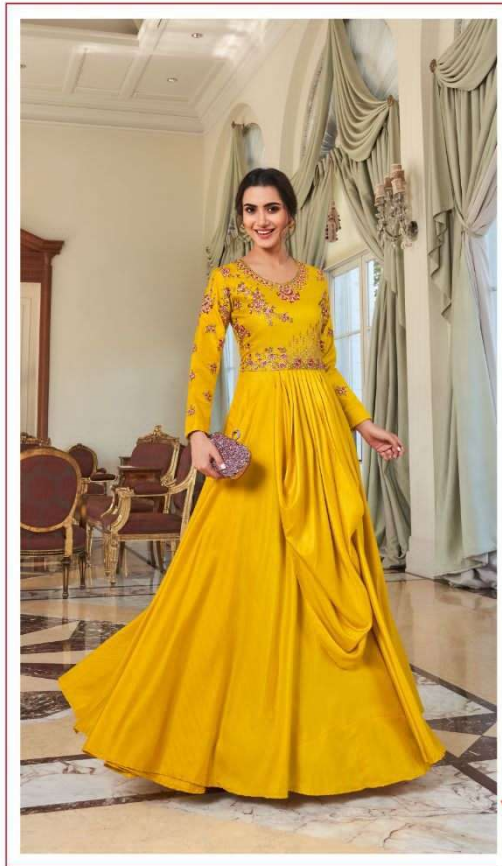
EVERYTHING YOU NEED TO REFRESH YOUR FESTIVE WARDROBE FROM DATELESS DRAPES TO THE COLOR CRAZE OF THE SEASON.