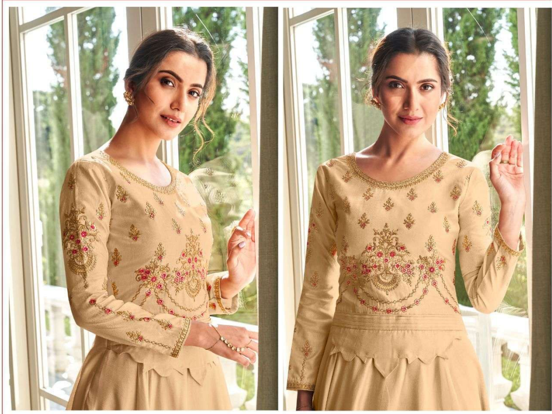
BY THE PATTERNS & VIBRANT COLORS OF POISONOUS YET BEAUTIFUL CREATURES.