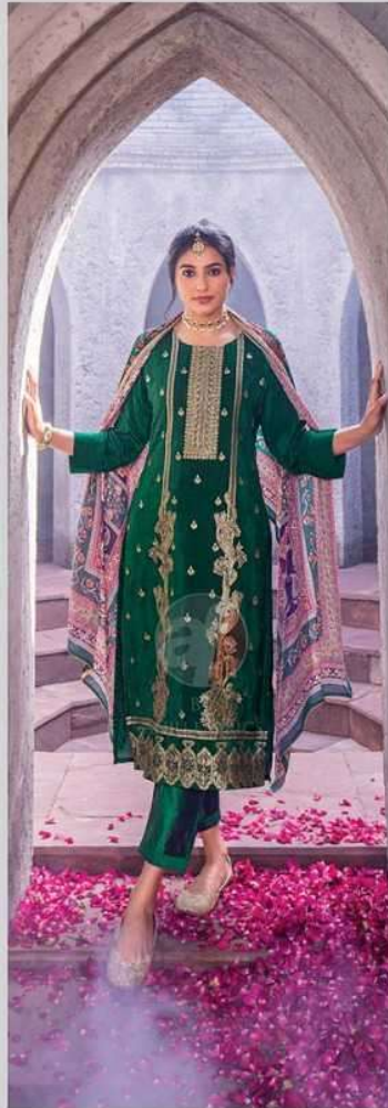
DASTOOR 3622 Volume 7