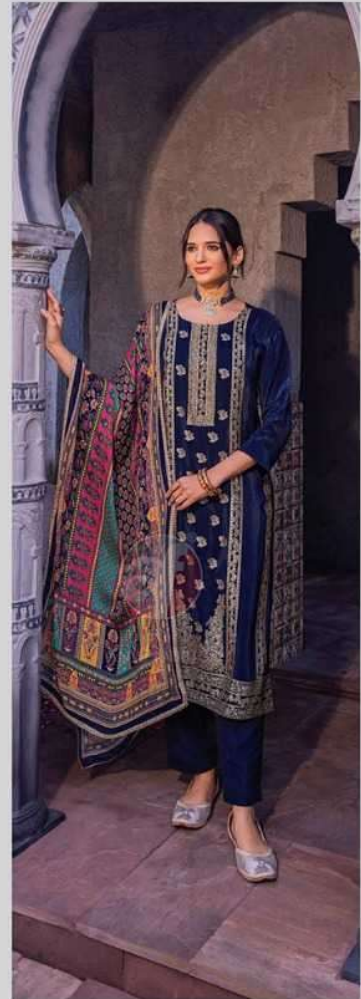
DASTOOR 3623 Volume 7