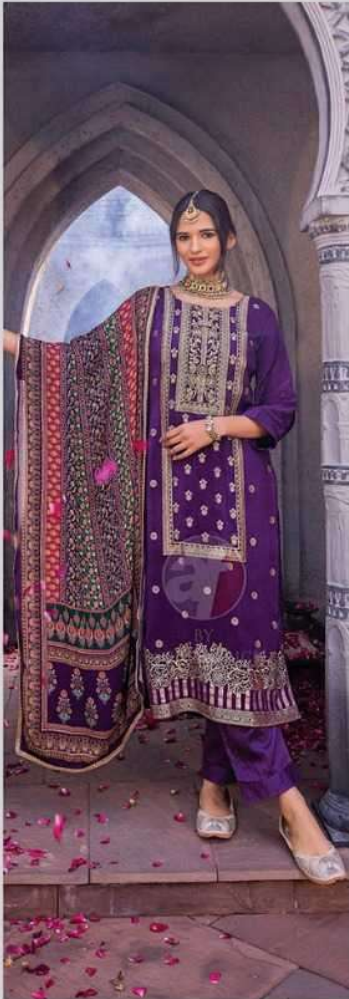
DASTOOR 3621 Volume 7